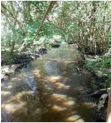
Figure 2. Channel feeding the mangrove with fresh water.