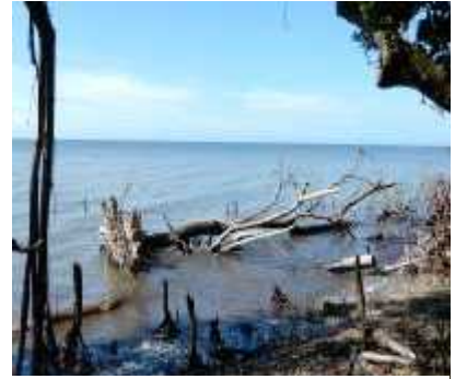
Figure 1. Black mangrove tree uprooted by the waves. Coast line is devoid of red mangrove.

Red mangrove mortality in the Mayabeque province was initially caused by uncontrolled logging and changes in the area's water regime, caused by the Mayabeque River channeling and road construction parallel to the coast (e.g., the road that communicated Batabanó with Mayabeque Beach), which interfered with nutrient and fresh water laminar flow into the mangrove. As of 2012, all the mangroves in Cuba are under the guise of coastal protection forests, which prohibit logging.