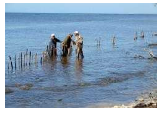
Figure 3. Palisades established to reduce wave force and promote red mangrove establishment and growth.

Activities for the reestablishment of the red mangrove coastal belt include: (a) dredging and maintaining the freshwater channels towards the mangrove to lower the salinity to levels tolerated by the red mangrove (Figure 2) ), (b) establishing palisades in the sea a few meters from the coast to reduce the force of the waves on the substrate (Figure 3), (c) selectively removing black mangrove trees to partially open the canopy and (d) planting red mangrove propagules beneath the black mangrove forest. Seed sowing was initially carried