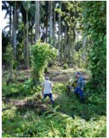
Figure 6. Two workers in the process of cutting the trunk of Tropical Almond tree that had been felled.

( Dichrostachys cinerea ). These species compete with native species and hinder their recruitment, which reduces their biological diversity and resilience. This strategy involves the formulation of a management plan, which initially was determined to be focused only on casuarina. Marabú and leucaena were not included as they are not considered a major threat in this region. However, the project is also controlling the Tropical Almond tree, because it was determined that its impact on the swamp forest ecosystems was even stronger casuarina's. In addition, casuarina is experiencing high levels of mortality related to changes in the water table, anyway. Tropical Almond tree control is being carried out by cutting and harvesting adult trees (Figure 6).