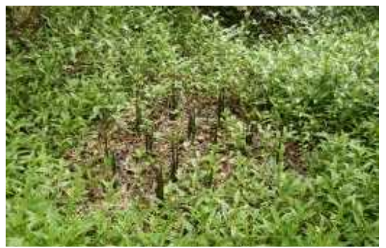
Figure 4. Red mangrove islands sowing system that involves planting the seeds in clusters of triads (three seeds sowed together),

out using individually spaced propagules. However, the staff of the implementation team indicated that the project advisor (Dr. Luz Esther Sánchez) recommended to sow them in groups of three (triads) and in aggregations of 15 to 25 triads (islands) to stimulate intraspecific competition and increase litter retention (Figure 4).